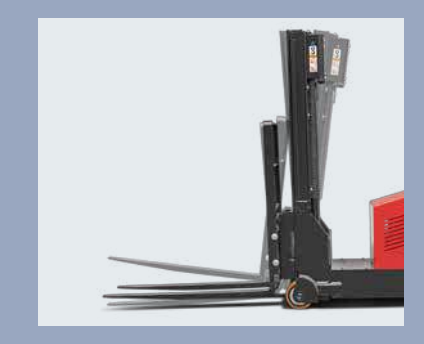
Mast tilting function is easy for entry in/out the nallet