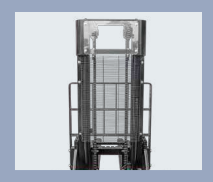
Mast can offer better rigidity and stability in comparison with C-shaped steel channels