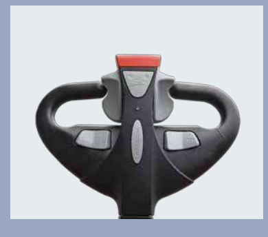
REMA tiller is simple but beautiful, and function buttons are comfortable for operation