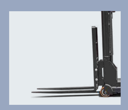
Lowering speed will automatically reduced when the fork is lowered to a height less than 3.9" from ground