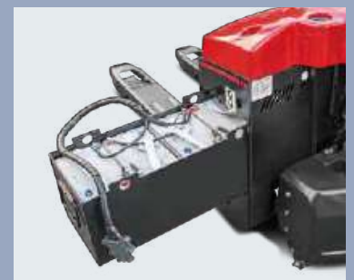
Battery side roll out