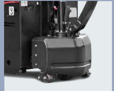
Additional wheels are equipped to have better stability