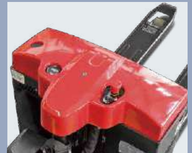
Modern outline design