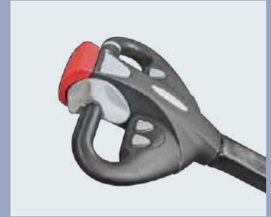
Rema tiller head