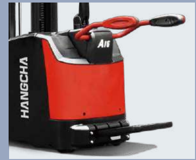
The integrated stamping molded guardrail offers better protection for the operator