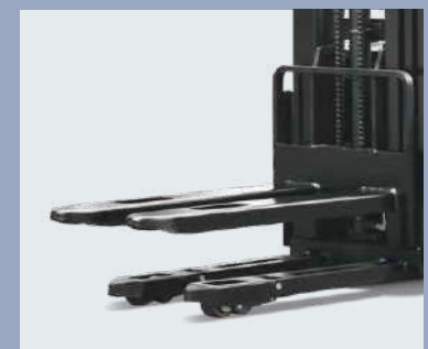
Tandem load wheel