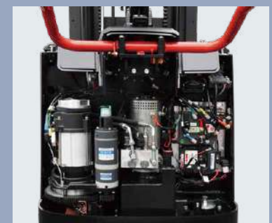
Back cover can be opened fully, and all components and parts are clear at a glance, which is very convenient for maintenance of the entire machine